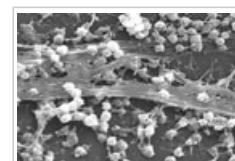
Bacteria that grow as a biofilm are able to survive hostile conditions.

Antibiotic use is still the main cause of antibiotic resistance in clinical practice even if biocide use may play a role. To safeguard our ability to treat infections with antibiotics, a good hygiene to prevent infection and the appropriate use of biocides are crucial.