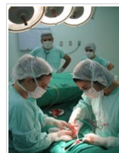
Biocides are used in hospitals to prevent and control infections.

6.4 Biocides are used in such large volumes that they can be found in small concentrations throughout the environment. There is a concern that continually exposing bacteria to biocide could lead to the emergence of resistant strains but this has not yet been clearly shown in practice.