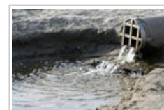
Biocides are discharged with wastewater.

3.5 Because biocides are used in large volumes and discharged with wastewater, they are present at low concentration throughout the environment. There is concern that this could lead to the selective survival of resistant bacteria.