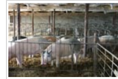
Biocides are used when breeding and raising livestock.

2.4 When breeding and raising livestock , the animals themselves, their products and any housing and equipment used are usually treated with biocides to decontaminate them, prevent the growth of potentially harmful micro-organisms and protect the animals from diseases.