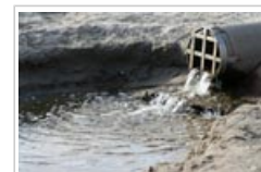
Biocides are discharged with wastewater.

3.5 Because biocides are used in large volumes and discharged with wastewater, they are present at low concentration throughout the environment. There is concern that this could lead to the selective survival of resistant bacteria.