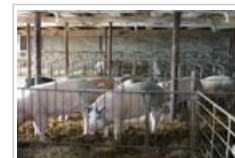
Biocides are used when breeding and raising livestock.

2.4 When breeding and raising livestock , the animals themselves, their products and any housing and equipment used are usually treated with biocides to decontaminate them, prevent the growth of potentially harmful micro-organisms and protect the animals from diseases.