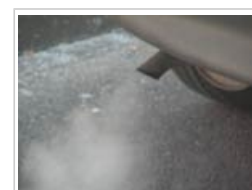
In urban areas, most nanoparticles come from diesel engines or cars with defective or cold catalytic converters

4.2 In the gas phase , both naturally occurring and engineered nanoparticles are generally created by chemical reactions whereby gases are converted into tiny liquid droplets which then condensate and grow. They rarely originate from the breaking down of larger particles.