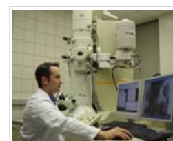
A scientist operating an electron microscope

7.1 Detecting nanoparticles is difficult, both in gases and in liquids. Nanoparticles are so small that they can only be detected by electron microscopes. Instruments able to detect and analyse particles of a few nanometres were only developed recently.