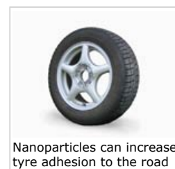
Nanoparticles can increase tyre adhesion to the road

Nanoparticles can contribute to stronger, lighter, cleaner, and “smarter” surfaces and systems . They are already being used to produce scratchproof eyeglasses, crack-resistant paints, anti-graffiti coatings for walls, transparent sunscreens, etc.