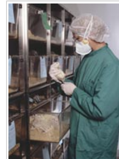
Careful analysis of the results of tests on rodents could reduce the number of primates needed

In addition, clear information on the species and number of animals used for experimentation as well as on the types of tests involved should be publicly available.