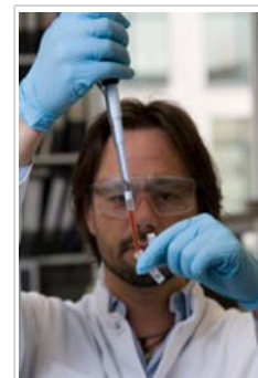
Tests are first carried out on cells grown in the laboratory

Alternatives to the use of non-human primates (NHPs) in research and testing do exist and can complement but not yet completely replace testing on these primates. As far as possible, the number of animals used should be reduced, methodologies should be refined, and the use of animals should be replaced by alternative methods (3Rs principle).