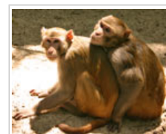
New standards of care, treatment and living conditions are needed