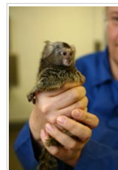
Only few candidate pharmaceuticals are actually tested on primates

2.1 Before pharmaceuticals reach the consumer, their safety has to be tested on humans during clinical trials. Preliminary experiments on animals – often rats and dogs – are intended to protect the health of people taking part in these trials. Only few candidate pharmaceuticals are actually tested on non-human primates (NHPs). Primates are needed to test certain drugs with potential effects on female genital organs, eyes, birth outcomes, blood coagulation, or the brain, as they are the only mammals with specific physiological traits similar to humans.