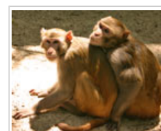
New standards of care, treatment and living conditions are needed