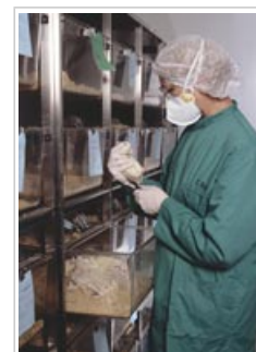
Careful analysis of the results of tests on rodents could reduce the number of primates needed

In addition, clear information on the species and number of animals used for experimentation as well as on the types of tests involved should be publicly available.