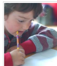
Exposure of children to phthalates from erasers is from chewing or licking.

The exposure of children to DEHP and DINP from erasers by licking and chewing depends on how long they keep the eraser in their mouths, how many small bits of eraser they swallow, how much of the phthalates passes into saliva or into gastric juice, and how the substance is taken up by the body through digestion.